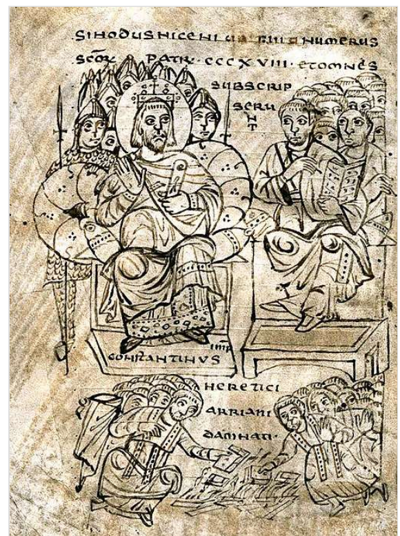
Constantine burning Arian books, illustration from a compendium of canon law , c. 825

In the Arian view, God the Father is a deity and is divine; the Son of God is not a deity, but is still divine. [41] God the Father sent Jesus to earth for salvation of mankind. [61] Ousia is essence or being, in Eastern Christianity , and is the aspect of God that is completely incomprehensible to mankind and