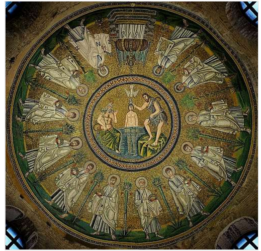
The ceiling mosaic of the Arian Baptistery , built in Ravenna by the Ostrogothic King Theodoric the Great .

The remaining tribes – the Vandals and the Ostrogoths – did not convert as a people nor did they maintain territorial cohesion. Having been militarily defeated by the armies of Emperor Justinian I , the remnants were dispersed to the fringes of the empire and became lost to history. The Vandalic War of 533–534 dispersed the defeated Vandals. [102] Following their final defeat at the Battle of Mons Lactarius in 553, the Ostrogoths went back north and re-settled in south Austria.