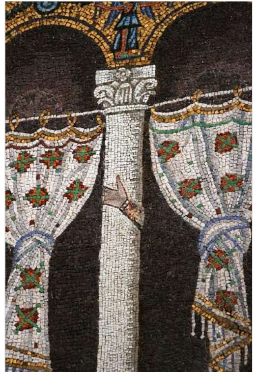
Once the orthodox Trinitarians succeeded in defeating Arianism, they censored any signs that the perceived heresy left behind. This mosaic in the Basilica of Sant'Apollinare Nuovo in Ravenna has had images of the Arian king, Theoderic, and his court removed. On some columns their hands remain.

The debates among these groups resulted in numerous synods, among them the Council of Serdica in 343, the Fourth Council of Sirmium in 358 and the double Council of Rimini and Seleucia in 359, and no fewer than fourteen further creed formulas between 340 and 360. This led the pagan observer Ammianus Marcellinus to comment sarcastically: "The highways were covered with galloping