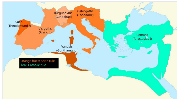
Arian and Chalcedonian kingdoms in 495

In the west, organized Arianism survived in North Africa, in Hispania, and parts of Italy until it was suppressed in the 6th and 7th centuries. Visigothic Spain converted to Nicene Christianity through their king Reccared I at the Third Council of Toledo in 589. [104] Grimoald , King of the Lombards (662–671), and his young son and successor Garibald (671), were the last Arian kings in Europe. [105][106]