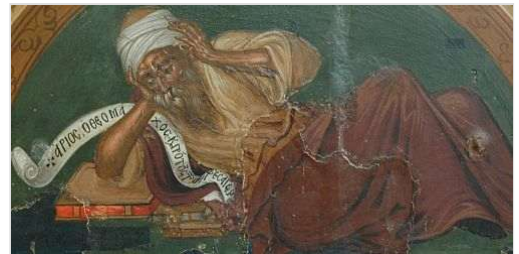
An imagined portrait of Arius. Detail of a Cretan School icon , c. 1591, depicting the First Council of Nicaea

Arius had been a pupil of Lucian of Antioch at Lucian's private academy in Antioch and inherited from him a modified form of the teachings of Paul of Samosata . [27] Arius taught that God the Father and the Son of God did not always exist together eternally. [28]