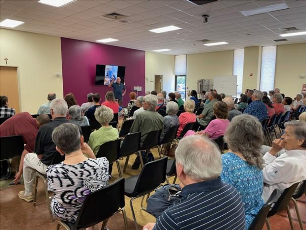
The parish arranged a photo display of some great moments at St. Bernadette, including my appearance at a fundraiser as a clown!