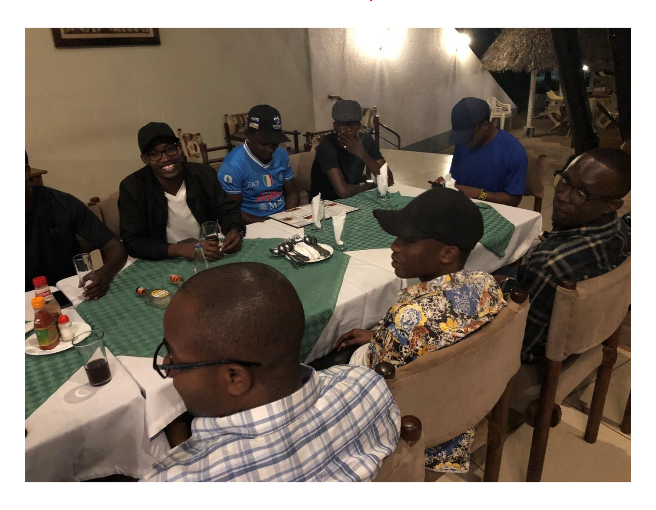
More to come on www.resurrectionists.ca.