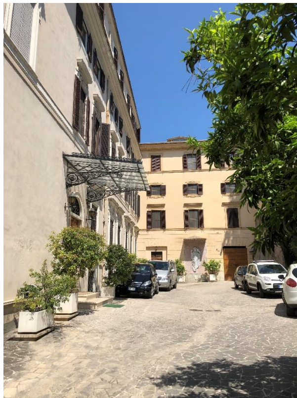
The main building (left), seminary building.