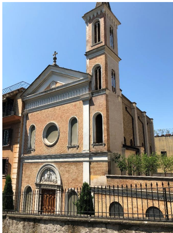
The chapel at the Resurrectionist Motherhouse.