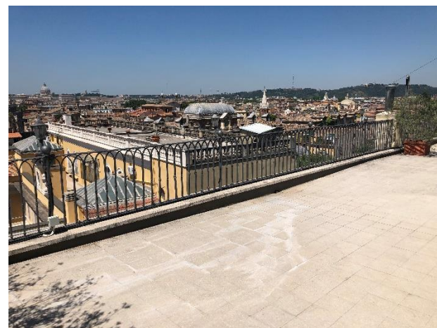
Roof top views from the Motherhouse in Rome.

Visit CR's in Action https://resurrectionists.ca/