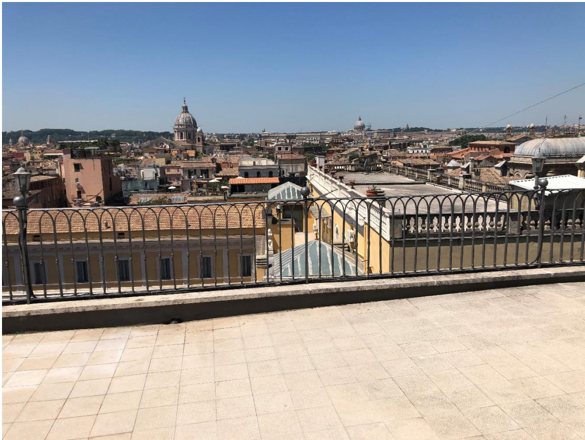
This photo is from the roof top. You can see St. Peter's Basilica right of center in the photo...about a 30 minute walk from our motherhouse.

The highlight of the house, however, is the rooftop that overlooks the city of Rome, with the St. Peter's in the background.