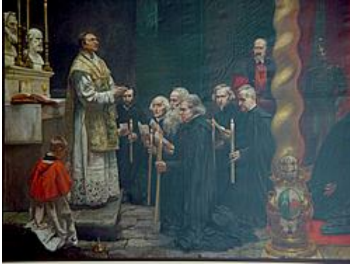
First vows of the Founders in St. Sebastian Catacombs.