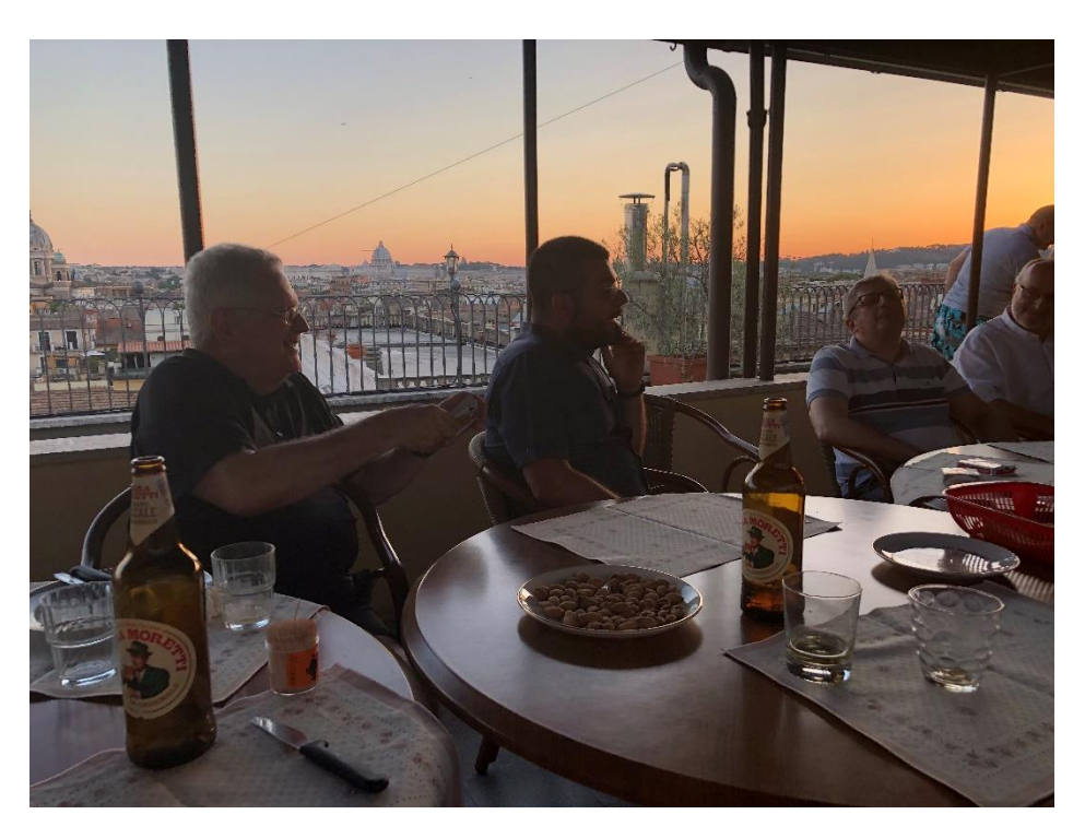
Visit CR's in Action https://resurrectionists.ca/