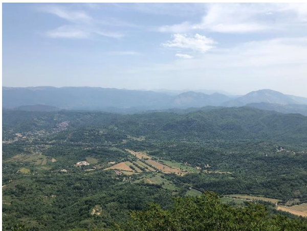
A view of the valley from the top of Mentorella.