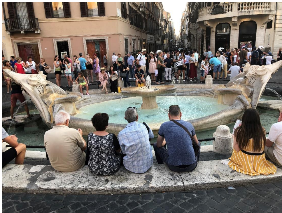
The fountain at the foot of the Spanish Steps.