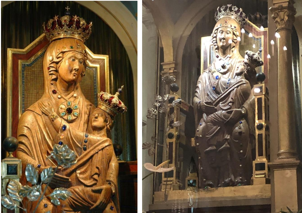
The view from the mountain top is breathtaking.

At the back of the sanctuary is the statue of Our Lady of Mentorella, Mother of Graces.