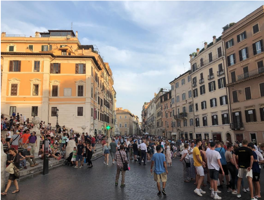
In this photo, the Spanish Steps are on the left and the fountain is on the right.

Our Motherhouse is only a block from the Spanish Steps. At this time of year, the piazza is streaming with tourists.