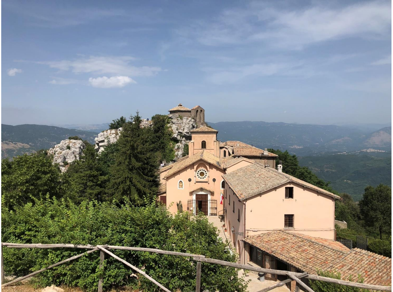
The shrine is built into the top and side of the mountain.