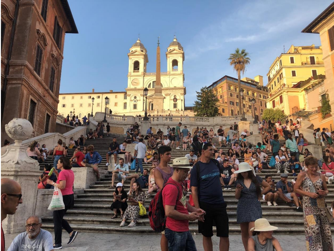
The church at the top of the Spanish Steps is Trinità dei Monti, 16th-century church under the responsibility of the French State.