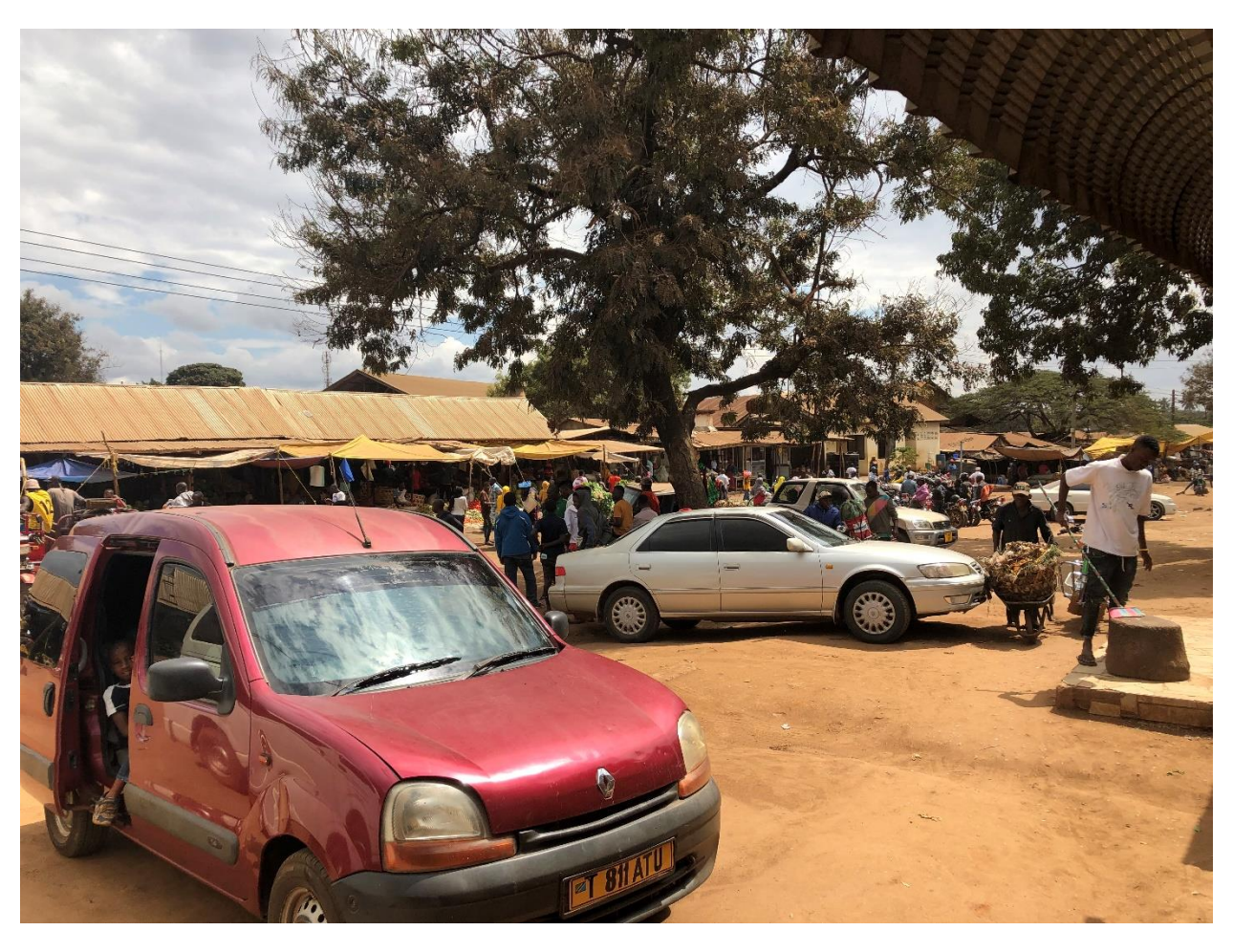
This is a photo of the paring area outside the market, which is to the left. There are more motorcycles and bicycles than cars.