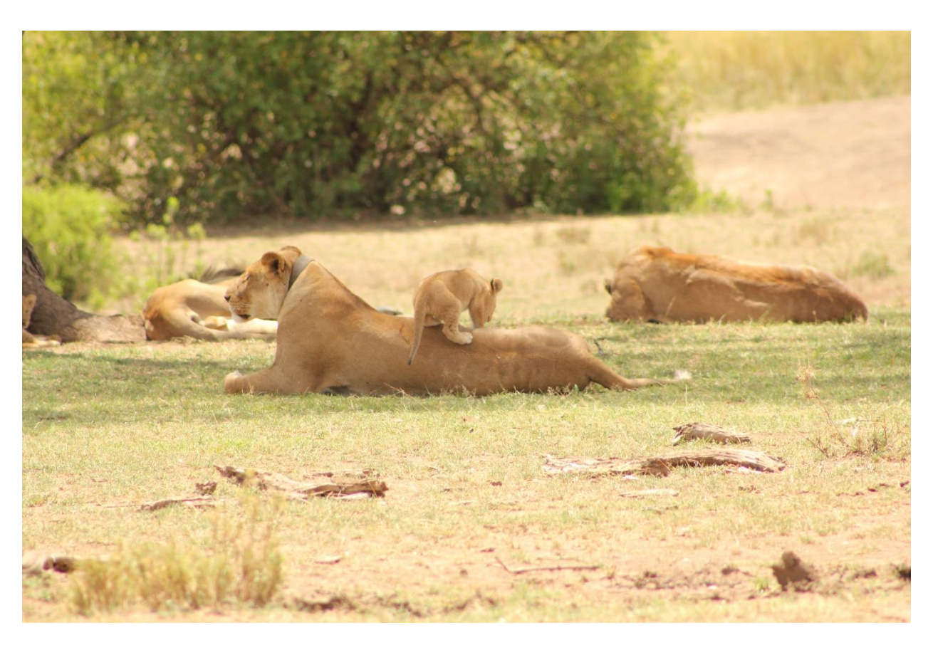
Some lions just want to get away from the crowd and grab some slumber time!