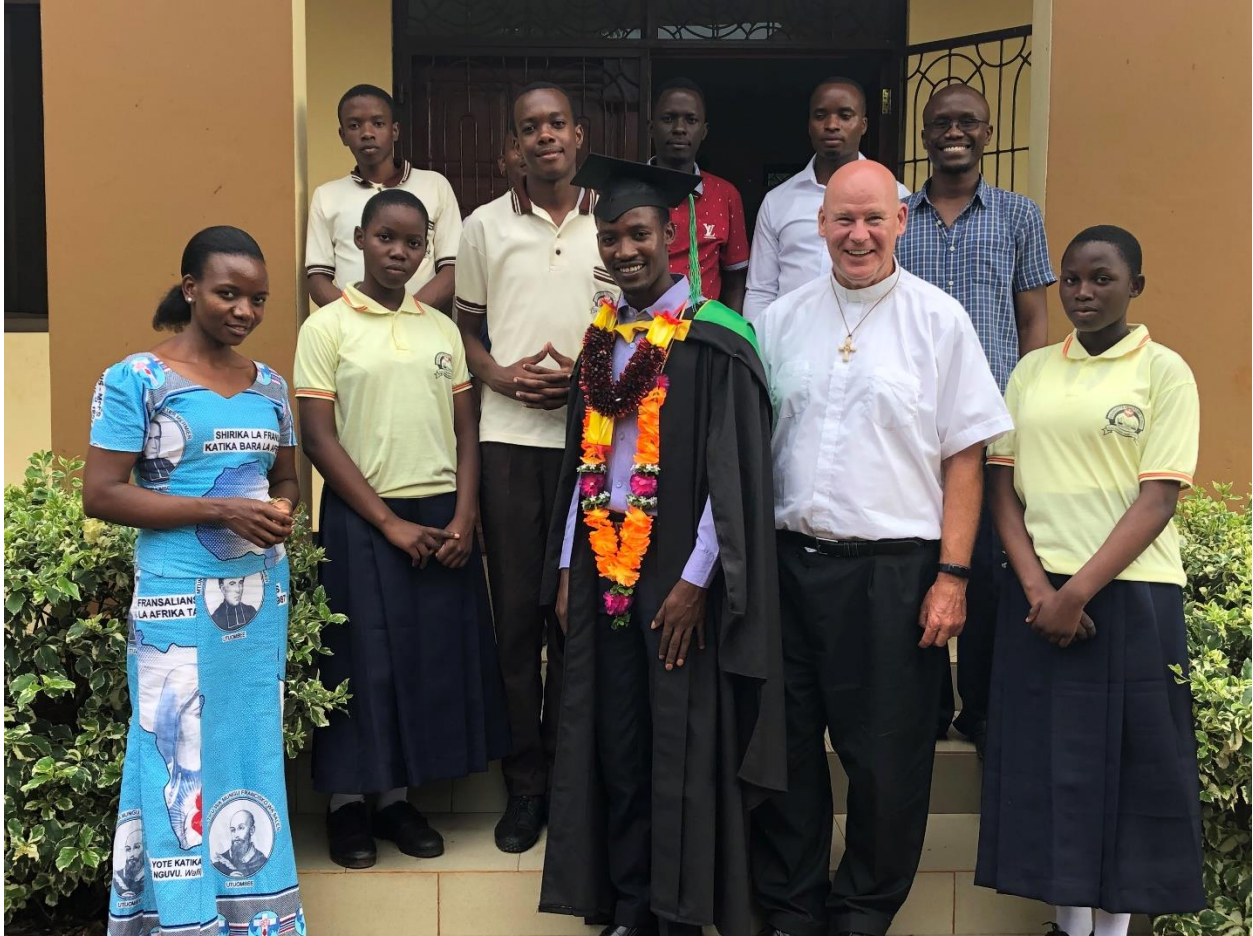
And, look who wanted to get into the celebratory photos!