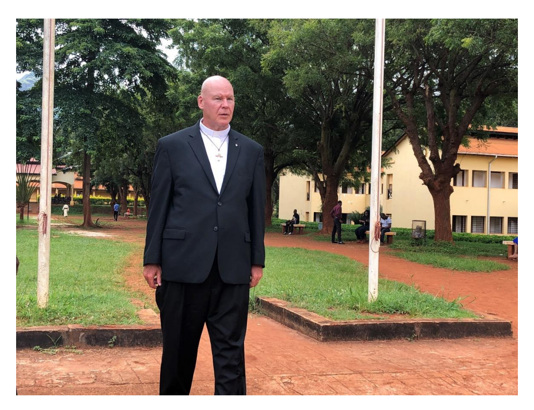
Not everyone looked like they knew what was happening!