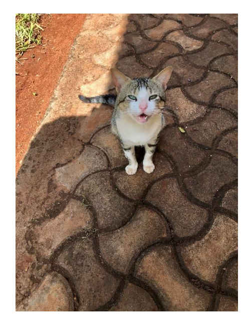
Visit CR's in Action https://resurrectionists.ca/