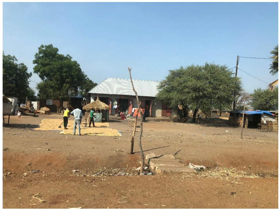
The men in this photo are spreading rice on pieces of plastic so that it will dry in the sun.