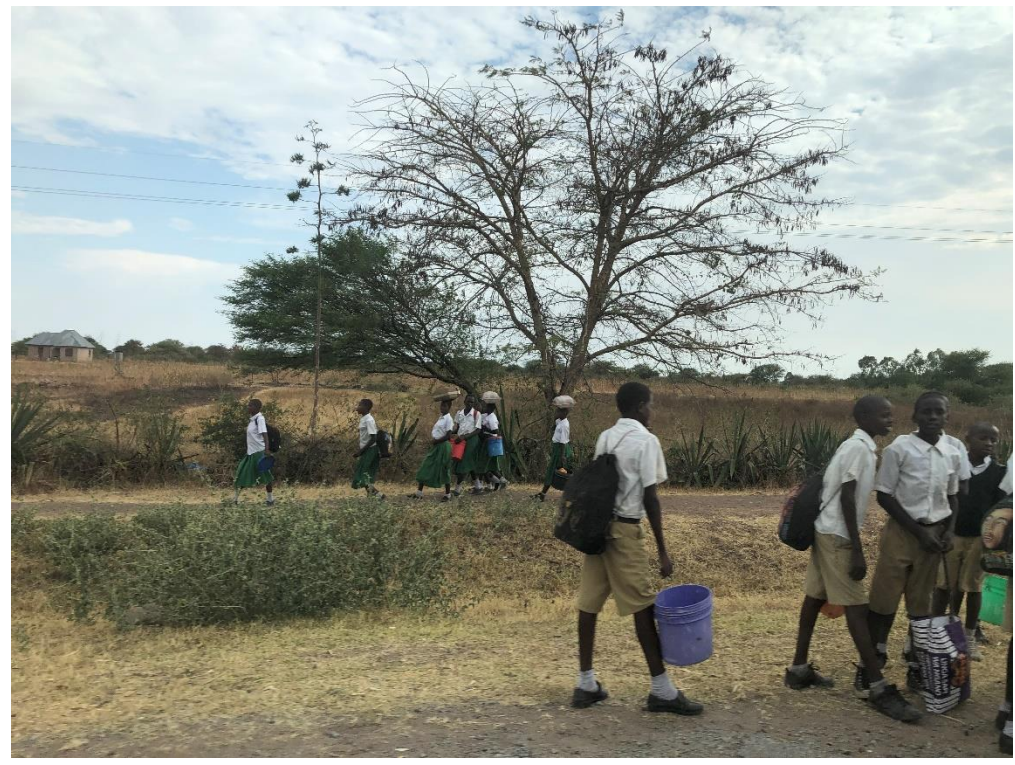
Students walking home after school.