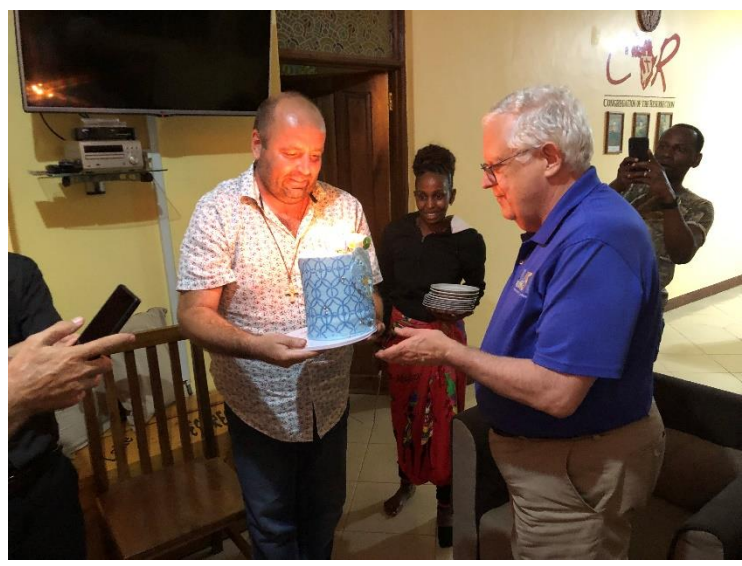
With the number of candles on the cake, I kept my eye on the location of the fire extinguisher.